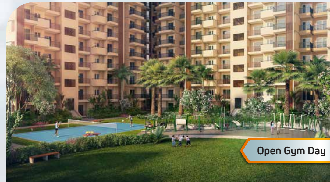
Open Gym Day