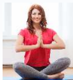
Yoga / Meditation